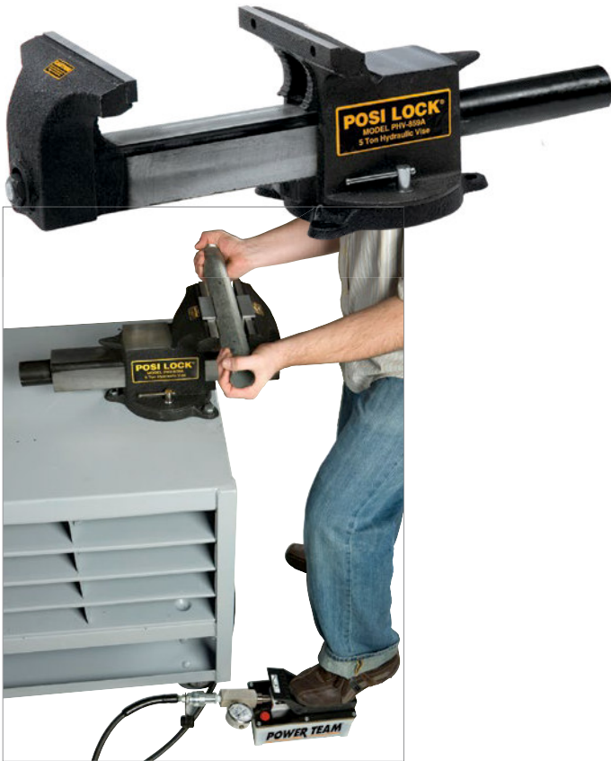
*Air supply is required when using a hydraulic pump